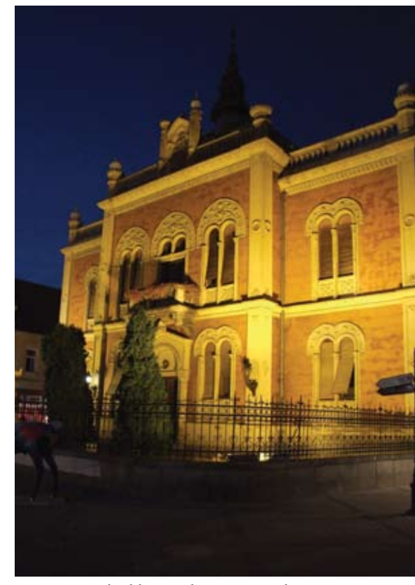
Government building in downtown Serbia.

Funding for the project was obtained from a multi-year grant from the U.S. Department of Agriculture's Foreign Agriculture Service.