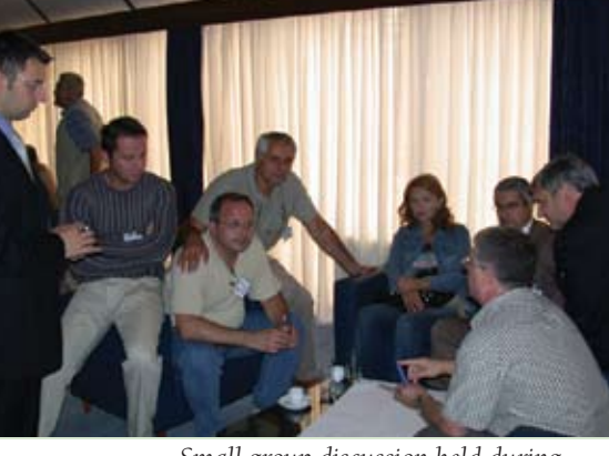
Small group discussion held during presentation by ISU swine veterinarians.

ISU swine veterinarians go abroad to exchange knowledge