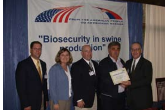
Presentation of certificates of completion to meeting participants.